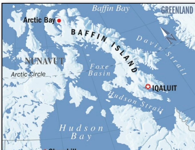
THE ULTIMATE FLOE EDGE EXPERIENCE - BELUGA, NARWHAL AND POLAR BEARS

Day travel by snowmobile and qamutik (pronounced: Kam-oo-tick) to the seasonal upscale base camp on the sea ice close to the floe edge. Along the way, you will experience first-hand how the Inuit travel to their summer camps. Qamutiks are sledges pulled by snowmobiles. Travel along the spectacular red hued St. George Cliffs towering 1000's of