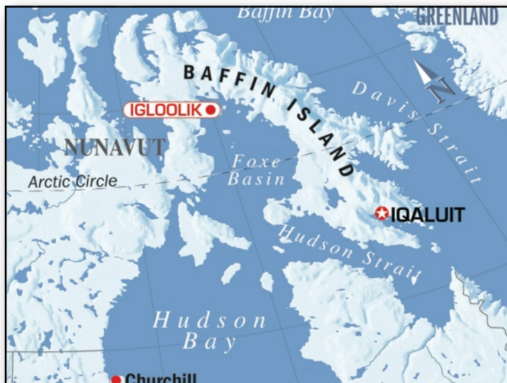
BOWHEAD WHALES, WALRUS & POLAR BEARS OF FOXE BASIN

We take our first visit to the floe edge – where land based solid sea ice meets the open water and familiarize ourselves with this new